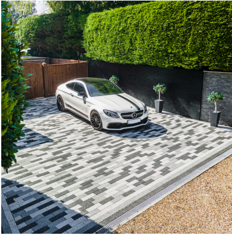
Pearl, Moonstone & Onyx