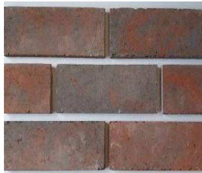
Redstone Multi 215x100x65mm