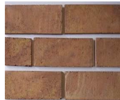
Amberstone Multi 215x100x65mm