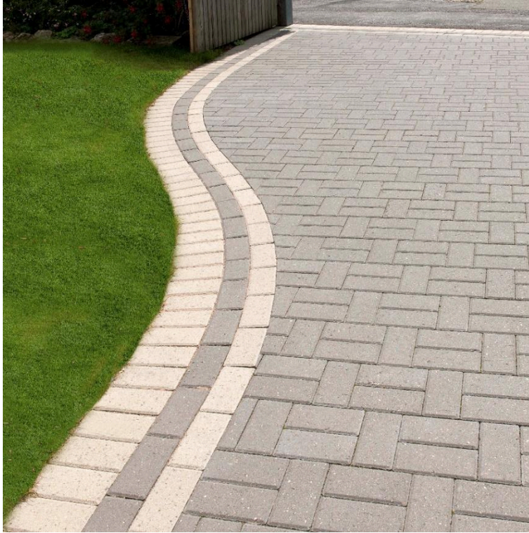
Charcoal and Natural