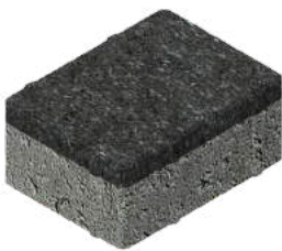
TRIO 60mm & 80mm** & Single Size Packs 60mm*** & 80mm**