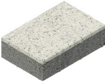
Single Size Packs 80mm