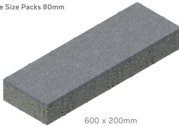
Single Size Packs 80mm