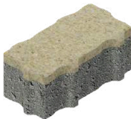
Permeable 60mm & 80mm