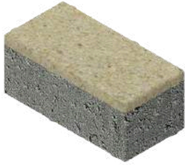
Single Size Packs 60* & 80mm