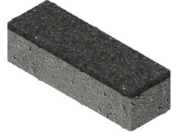
Single Size Packs 60 & 80mm*