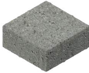
Single Size Packs 80mm*